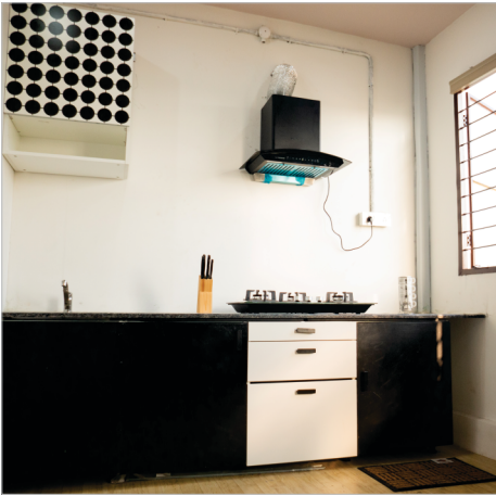
Free Model Stove with Chimney