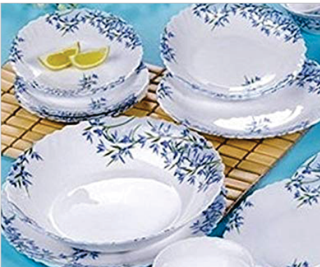
Free Dinner Crockery Set

Free Sandal Wood Plantation Maintained by Agriculture Experts (Sri Gandham, Malabar, Mango, Sapota, Guava, Lime, Pomegranate)