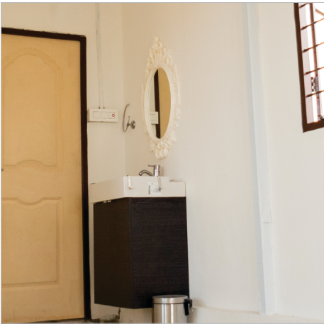
Free Wash Basin with Mirror