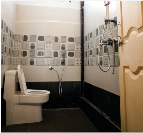
Free Parryware commode C.P. Fittings