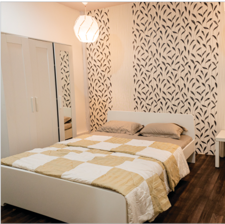
Free Double Bed Cot with Mattress