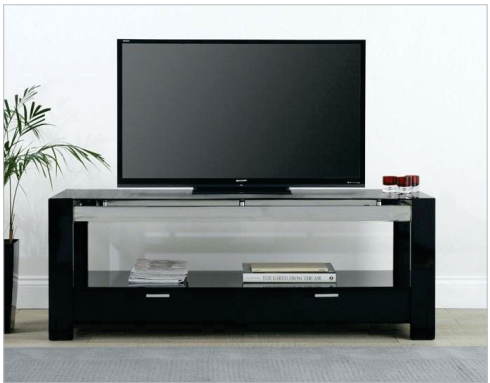
Free LED TV + Dish Connection