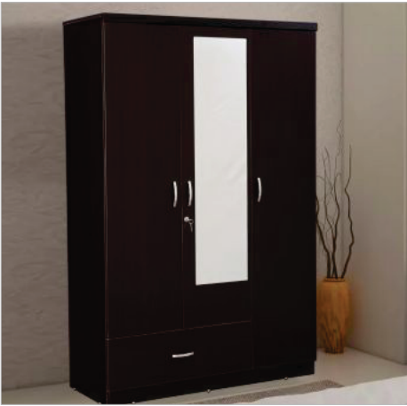
Free Wardrobe 2 Doors