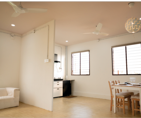
Free False Ceiling with 3 Fans