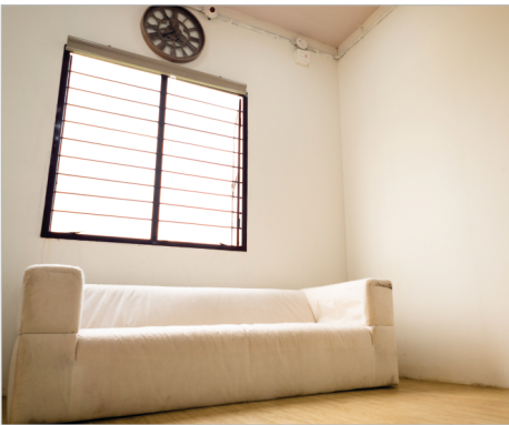
Free Sofa with 3 Sitter