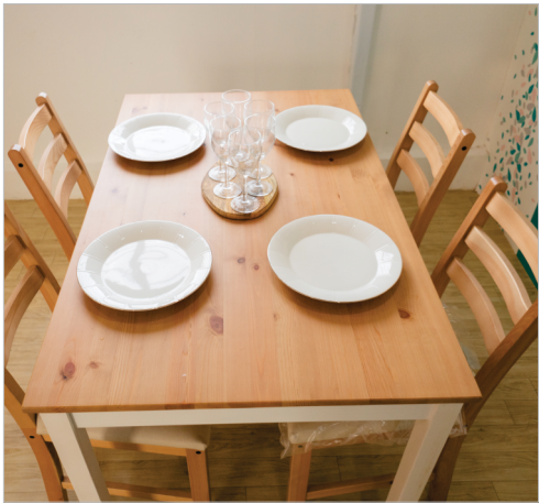
Free Dining Table with 4 Chairs