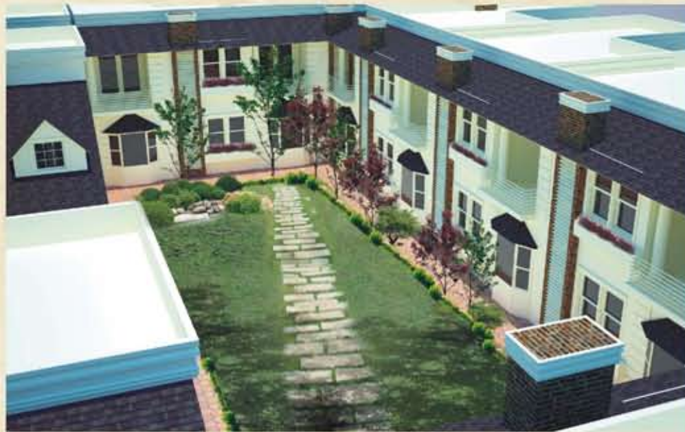
Elevation of Condo Homes

Live an exclusive and private lifestyle with premium Condo Homes.