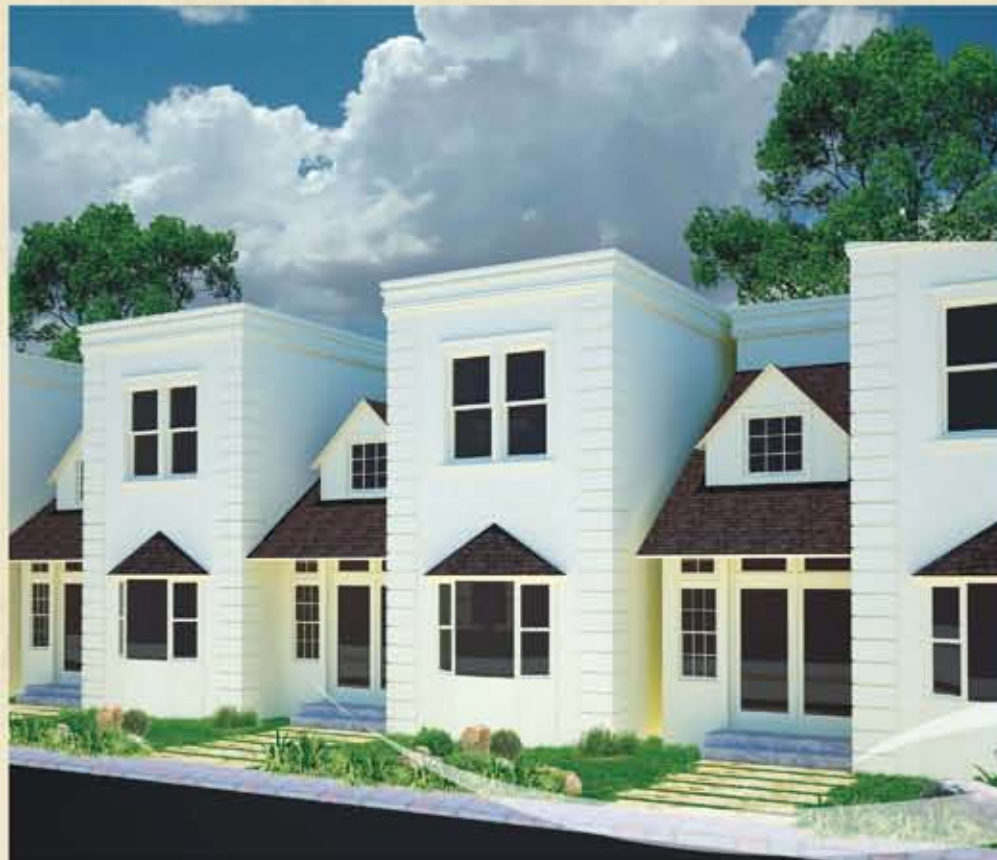
Close-up View of Condo Homes