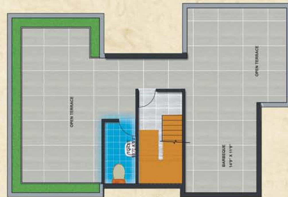
Terrace Floor Plan