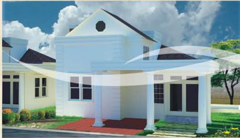
Town Home Elevation

Enjoy the peace and privacy in the lap of luxury at multi-functional Town Homes.