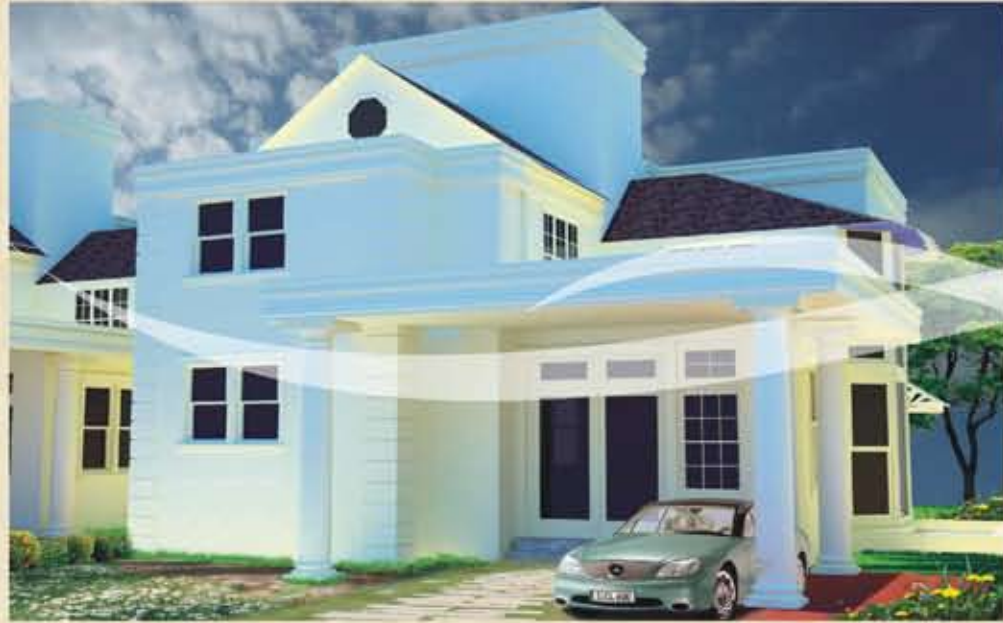
Duplex Villa Elevation

Get ready to upgrade your life with premium Duplex Villas.